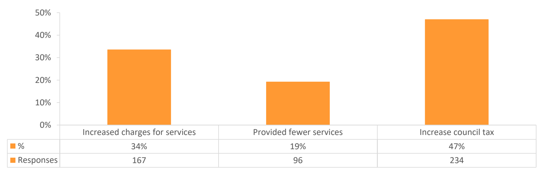
Council Tax In order to balance the budget, would you rather we; (please tick as many as apply)